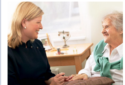
Respite services at Munzer Community Residence

All Jewish Care facilities provide respite services, allowing the carers to rest while their loved ones are staying in a friendly, inclusive environment where their cultural needs are respected and celebrated.