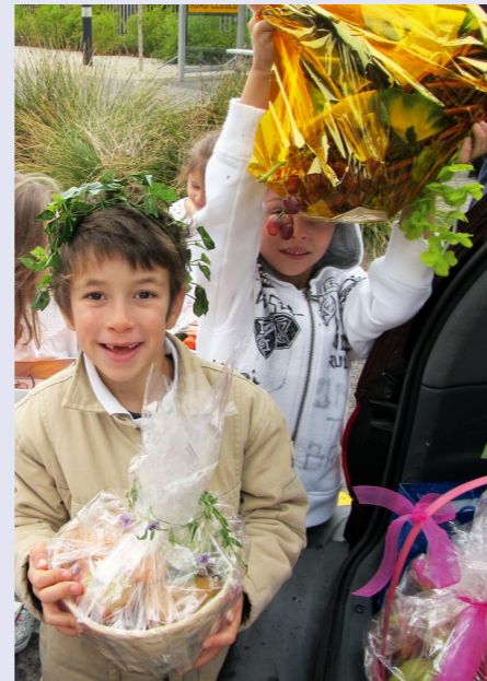
Bialik ELC children with their decorated Shavuot baskets

We appreciate the children's involvement in the joy of sharing and giving to those in need and thank them for their ongoing support and generosity.