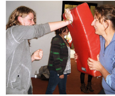
Young Achievers practising self-defence techniques

If you are aged 15-18 and willing to learn new skills, increase your confidence and build friendships within a great, fun environment, join the 2012 Young Achievers Program.