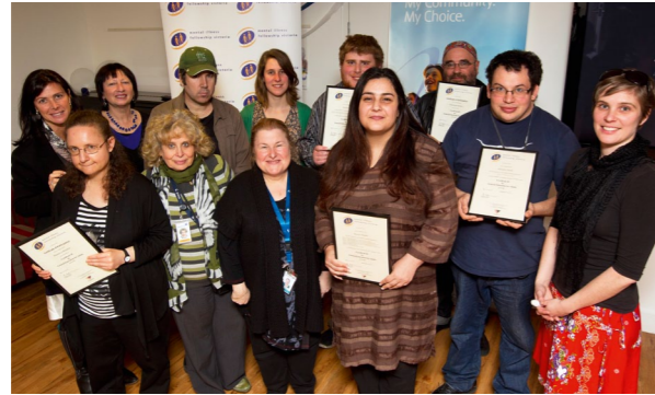
Proud participants celebrate with their counsellors and instructors

Twelve students participated in a unique, year-long Return to Learning Course, for adults who have experienced mental illness. Run in partnership with the Mental Illness Fellowship Victoria (MIFV), this nationally recognised course leads to the Certificate II in General Education for Adults.