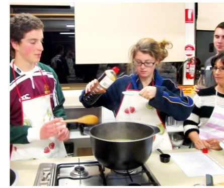
YAP participants discovering their culinary talents

The program encourages the youth to adopt a professional, can-do attitude and improve self-esteem.