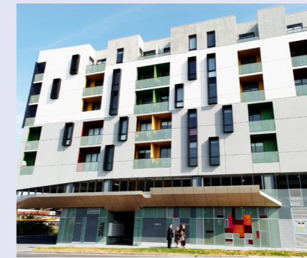
The new housing development in Moorabbin

In addition to offering immediate housing solutions, Jewish Care promotes a sustainable lifestyle