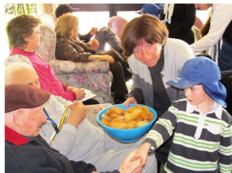
Children from Adass Israel School handing out honey biscuits to residents of Montefiore